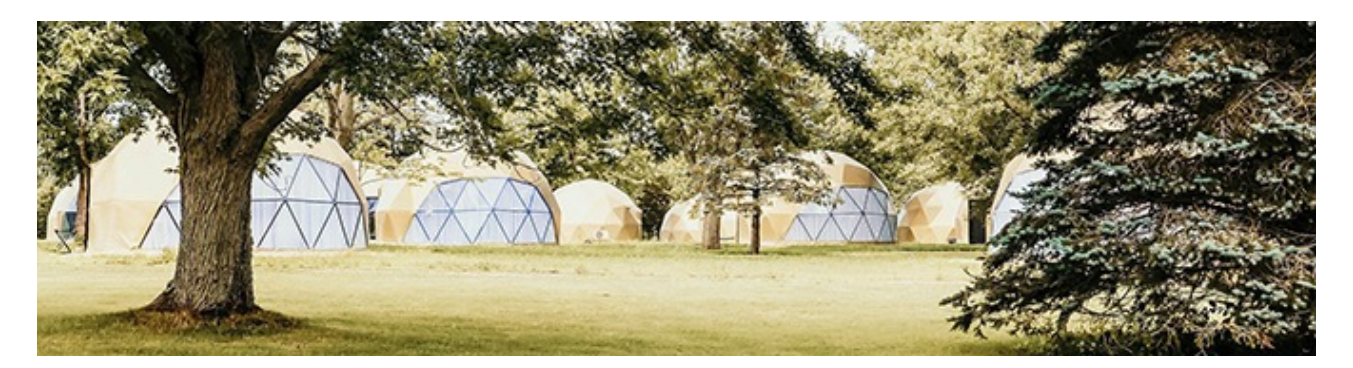
Day Dreamer Domes 397 Blue Star Highway South Haven, MI 49090